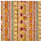
F4127002 CARMIN ÉCLATANT