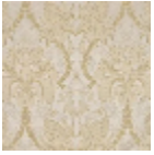
I6625001 Madre perla