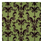
I6665001 VERDE ANTICO