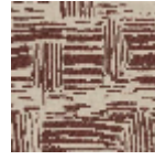
L3912_LABYRI NTHE_N3162_F G