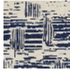
L3912_LABYRI NTHE_N3121_F E