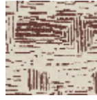
L3912_LABYRI NTHE_N3162_F E