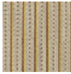
L4123_LES_PE RLES_Canevas _N3021_N3017_ FM