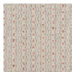
L4216003 Bleu rouge