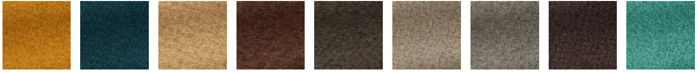
L4289_TDT_B5 8 Jaune L4289_TDT_B6 5 Bleu vert L4289_TDT_B6 7 Beige L4289_TDT_B6 8 Brun L4289_TDT_B6 9 Suie L4289_TDT_B7 0 Gris L4289_TDT_B7 1 Ardoise L4289_TDT_B7 2 Chocolat L4289_TDT_B7 3 Turquoise