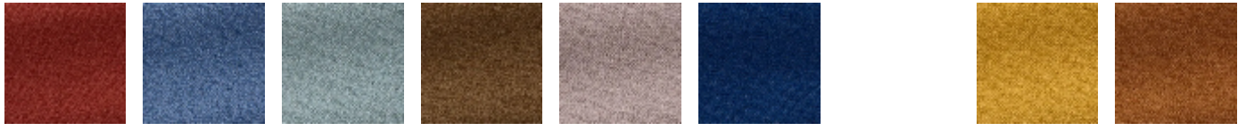
L4289_TDT_B4 1 Rouille L4289_TDT_B4 2 Bleu toile L4289_TDT_B4 5 Bleu ciel L4289_TDT_B4 6 Bronze L4289_TDT_B5 Ramie L4289_TDT_B5 3 Bleu marine L4289_TDT_B5 4 Bleu marine L4289_TDT_B5 6 Mais L4289_TDT_B5 7 Giroflée