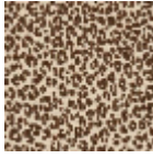
L4516_MINI_LE OPARD_N3159 _FE