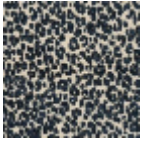
L4516_MINI_LE OPARD_C533_ FE