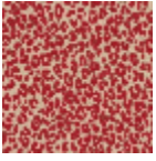
L4516_MINI_LE OPARD_B90_F G