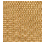
L4540_LOME_ N3143_FE_VER SO