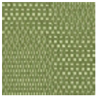
L4540_LOME_ B23_FE_VERS O