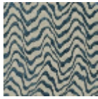
L4541_KENYA_ C534_FM_VER SO