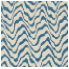
L4541_KENYA_ B21_B39_FE_V ERSO