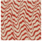
L4541_KENYA_ N3176_FG_VER SO