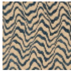
L4541_KENYA_ C534_FB_VER SO