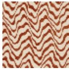
L4541_KENYA_ C517_FE_VERS O