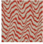
L4541_KENYA_ N3176_FM_VE RSO