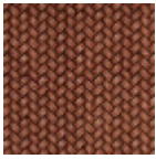
L5003_TRESSA GE_C509_C517 _FM