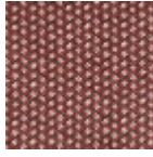
L5003_TRESSA GE_N3002_N31 76_FE