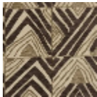
L5011_TACHAD _C510_C507_F G