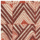
L5011_TCHAD_ N3015_N3024_ FE