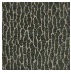
L5016_L'ANIMA L_C510_C538_F M