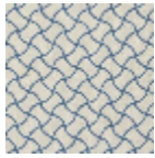
L5032_NAIADE _B21_FE_VERS O