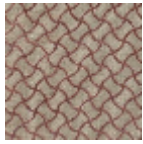
L5032_NAIADE _C517_C529_F M_VERSO