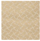
L5032_NAIADE _N3183_FB_VE RSO