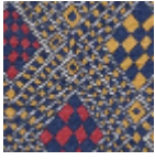
L5042_DJIBOU TI_C531_B58_B 02_FE