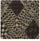
L5042_DJIBOU TI_C508_B67_ C509_FI