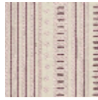
L5053_COCHI NE_N3012_N30 08_FE