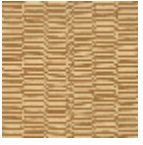
L5067_KATHM ANDU_B87_B5 7