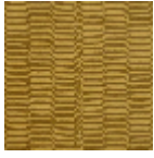
L5067_KATHM ANDU_C515_C 512