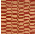
L5067_KATHM ANDU_C514_C 520