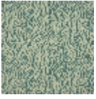
L5075_JAISAL MER_B65_B73 _FA