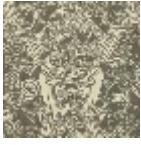
L5076_DRAPE RIES_N3023_N 3002_FE