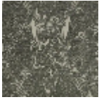
L5076_DRAPE RIES_C544_C5 08_FM