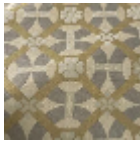
L5077_CASTEL NAU_N3004_N 3003_N3006_F G