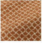
L5083_SILLON _B57_N3013_F E