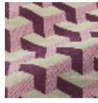
L5096_MAU RIT S_N3012_N300 8_FE