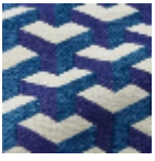
L5096_MAU RIT S_B38_C533_F E