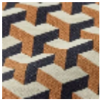
L5096_MAU RIT S_B57_B54_FE