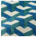
L5096_MAU RIT S_C533_C535_F E