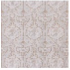
T0698001 Oyster black