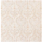
T0698002 Oyster natural