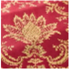
T0703001 Deep red