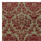
T0709001 Kenya red