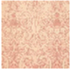
T0718002 NEW TOMATO