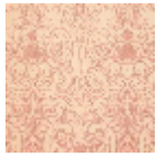
T0718002 NEW TOMATO