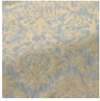
T0719003 Pale blue