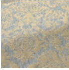
T0719003 Pale blue