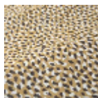
T0728003 Burnt gold