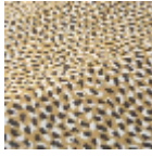
T0728003 Burnt gold