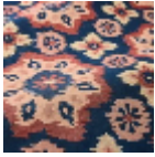
T0730003 Dark navy