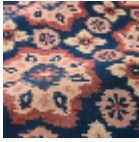
T0730003 Dark navy