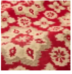
T0730001 Ogee red