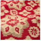
T0730001 Ogee red