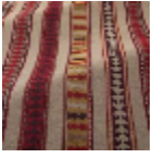
T0740001 Ogee red