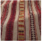
T0740001 Ogee red