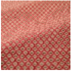
T0741001 Ogee red