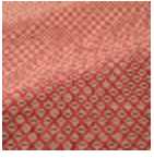
T0741001 Ogee red