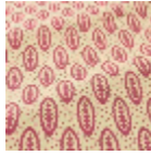
T0742004 Kenya red