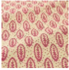
T0742004 Kenya red