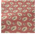
T0743002 NEW TOMATO