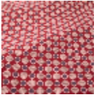
T0746001 Ogee red