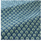
T0752003 Dark blue