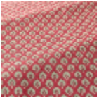
T0752001 Deep red