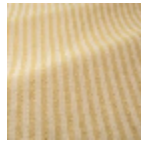
T0766004 Old gold