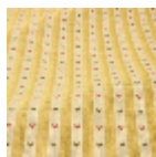
T0769002 Old gold