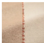
T0771002 Burnt orange