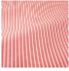
T0772002 Kenya red