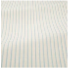
T0772001 Ice blue