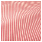
T0772002 Kenya red