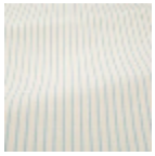
T0772001 Ice blue