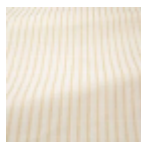
T0773002 Old gold