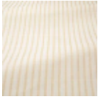
T0773002 Old gold