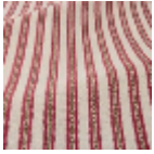
T0776003 Deep red