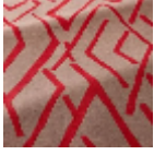
T0789002 DEEP RED